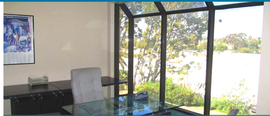
ABUNDANT GLASS LINE